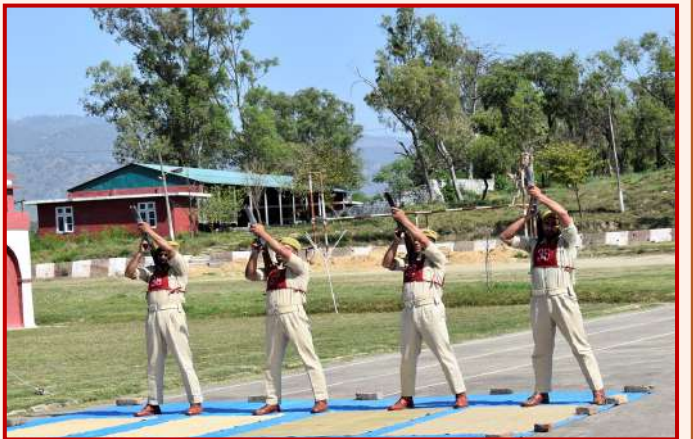
VOLLEY FIRE PRACTICE