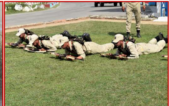
LEARNING FIELD CRAFT SKILLS