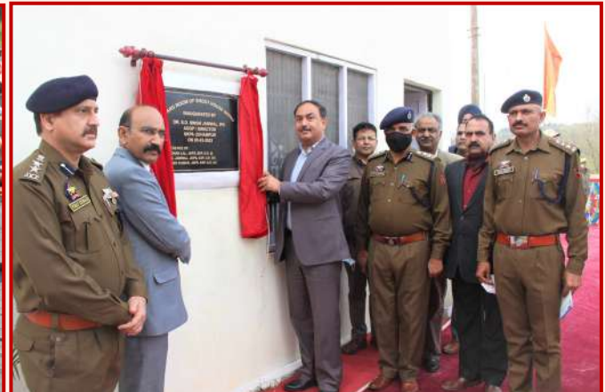
INAUGURATION OF GUARD ROOM