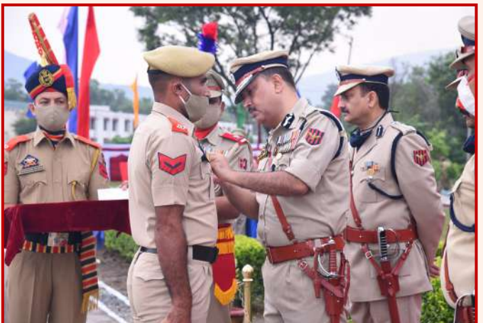
CELEBRATION OF INDEPENDENCE DAY