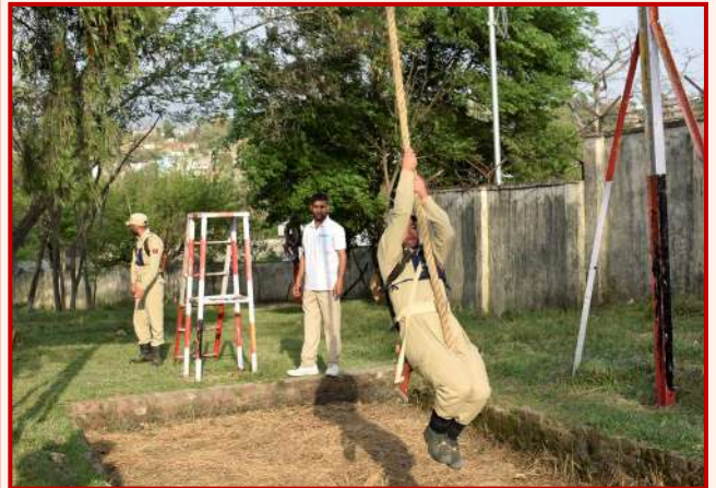
DURING OBSTACLES TRAINING