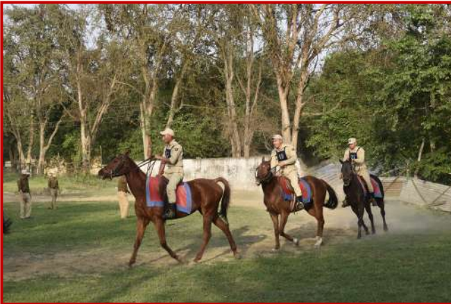
LEARNING HORSE RIDING