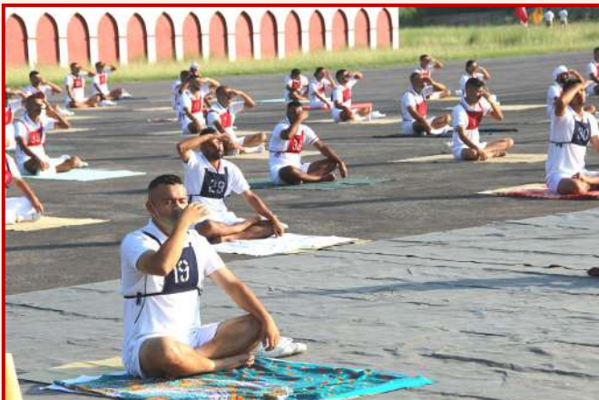
INTERNATIONAL YOGA DAY