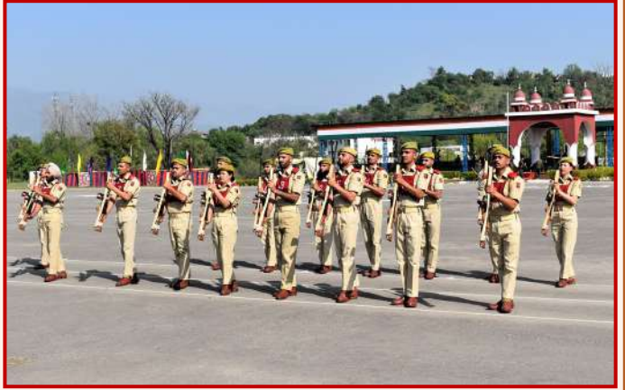
LEARNING DRILL WITH ARMS