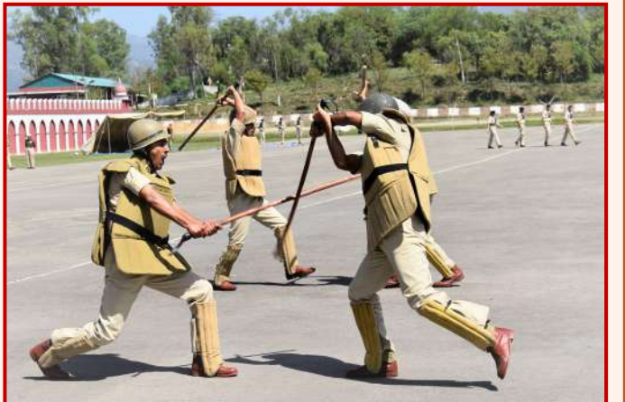
LEARNING MOB CONTROL DRILL