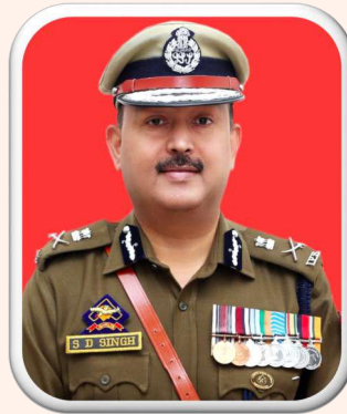
Director, Sher-i-Kashmir Police Academy Udhampur